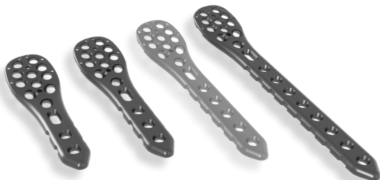
5-hole plate available upon request